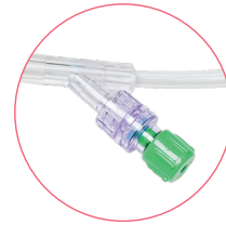
Luer Activated Valve