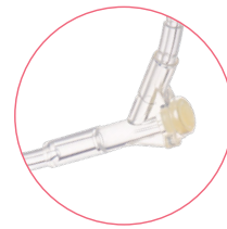
Needle Injection Site